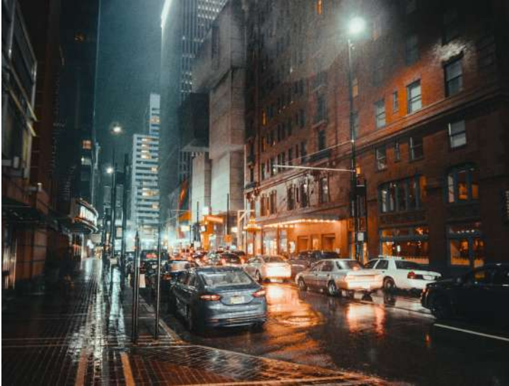
Photo: Factory farming green house gas emissions (GHGE) are compared with the number of cars on the road per year - North American city.