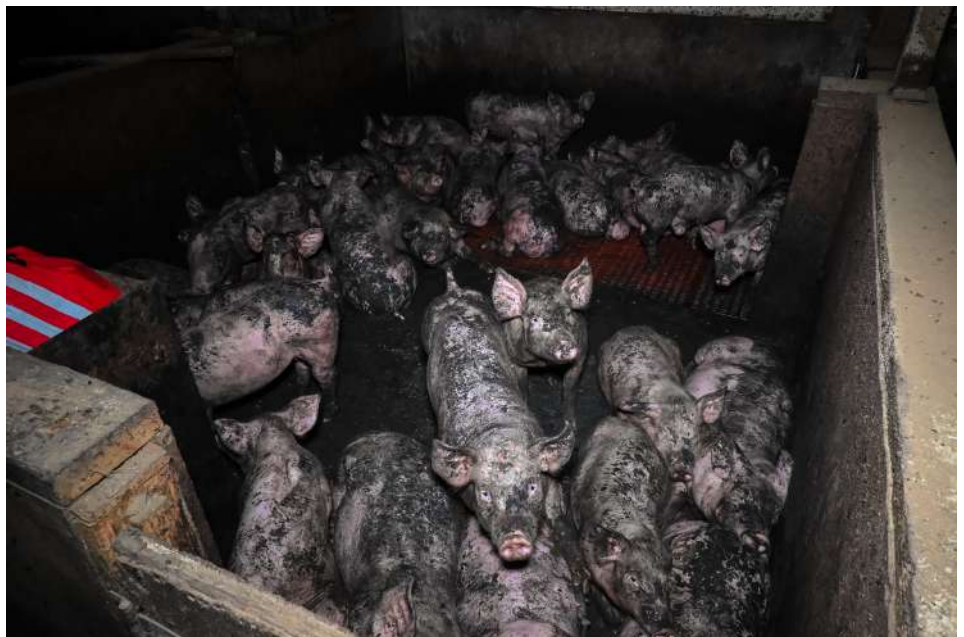
Photo: Overcrowded conditions for pigs at a factory farm in an undisclosed location in Europe. Factory farming is highly emissions-intensive.

The equation to calculate the total GHG emissions for each selected company was adapted from the Institute for Agriculture & Trade Policy (IATP) 5 methodology developed by the United Nations Food and Agriculture Organization - the Global Livestock Environmental Assessment Model (GLEAM) 6 .