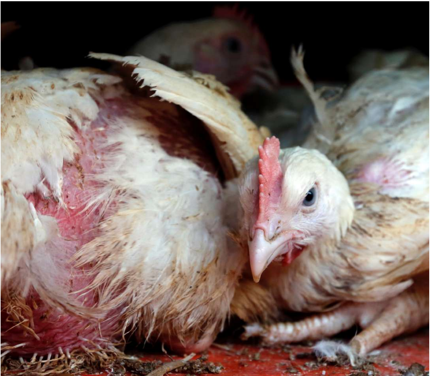
Photo: Broiler chickens in close confinement.

The scorecard also converts the emissions associated with commodity feed production to equivalent emissions associated with the number of cars on the road. The scorecard uses the results of Equation 1.2 (outlined above) to establish the emissions from commodity feed and then uses the same US EPA calculator to determine equivalency with cars on the road. Results are presented in Tables 9 and 10 in the Results section.