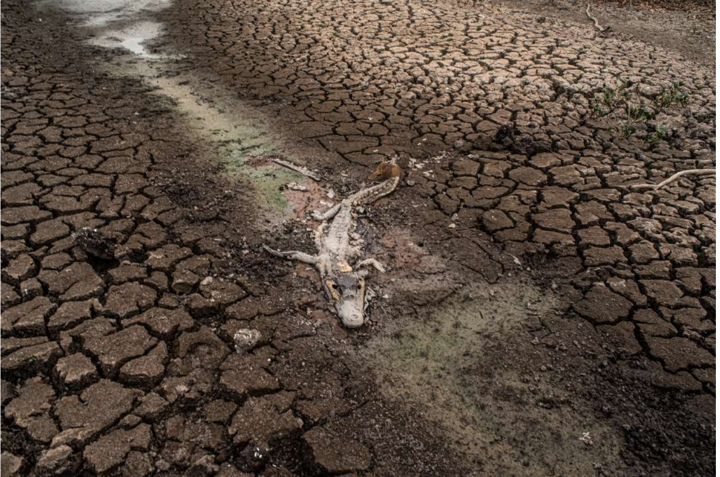
Photo: Wildlife is also affected by factory farming - Soy monocrop expansion for animal feed production generates bushfires. An alligator killed by the drought and forest fires that hit the Pantanal - Brazil in 2020.