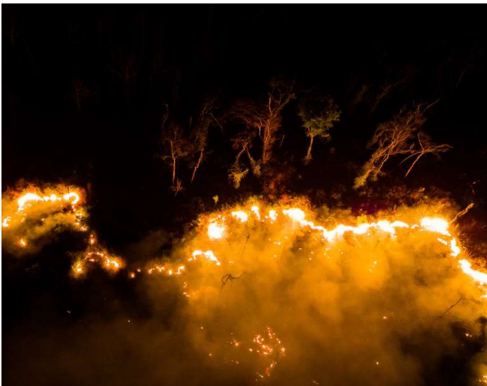
Photo: Fires are lit in Mato Grosso state, Brazil, to clear land for soy plantations. Most soy goes to feed farmed animals, not to people.